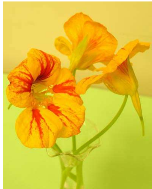
Nasturtium, Bernice Barratt