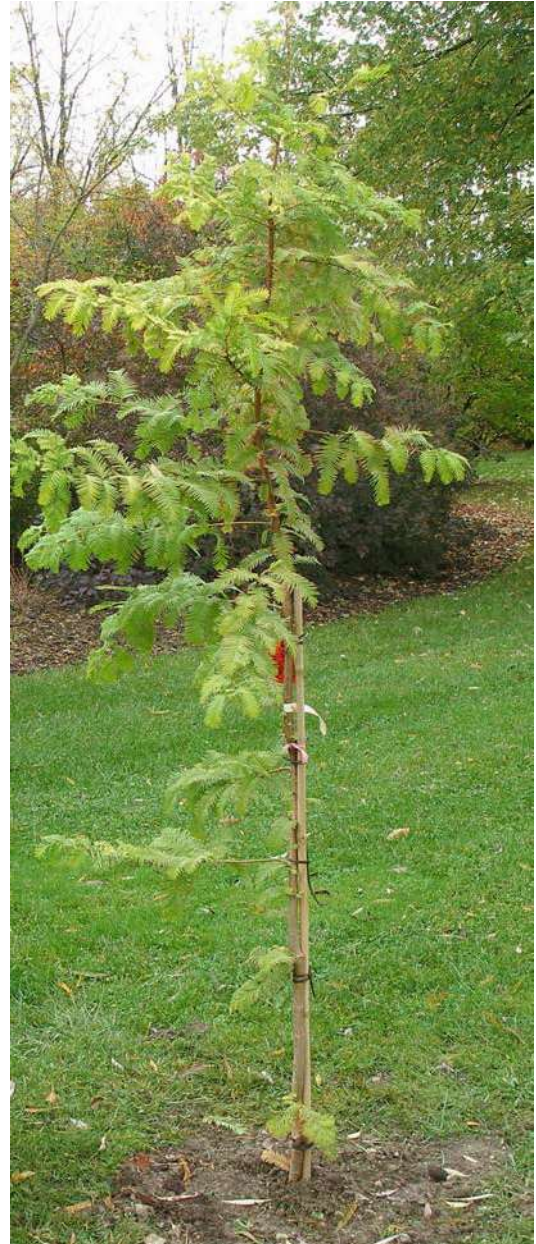
" Dawn " at Catharine East Garden

All the trees living today came from those seeds!!