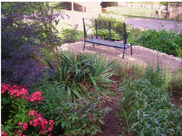
Centre Street Perennial Bed

Another accomplishment was erosion control at the Centre Street bed. We fortified the area under the seat with more crushed rock, added river rock to the edges of that area and put in a "dry stream bed" to direct rainfall to the front bottom of the bed -all we need now is the rainfall to see if these modifications will help! Once again Mike saved the day and Dennis Rawe provided all-season long help with maintenance and planting new specimens in this bed.