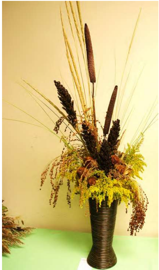
September 2011 Flower Show

The SDHS Exhibit and Floral Design Committee wants to extend their congratulations to ALL exhibitors from the June Flower Show. What a show it was! The peonies were outstanding and a big THANK YOU goes out to Darlene and Flo Bowman for their tips on holding peonies in limbo previous to a flower show! We had 25 adult exhibitors, 9 of whom were novices! It is nerve wracking to get entries ready but didn't you all have fun? There was a total of 154 exhibits and 47 of those were in design categories! What inspiring designs they were too! Considering we had a fairly new committee, started too late and had a new venue to set up, I was very pleased with the results. Thanks to everyone for their constructive comments and we are taking them seriously for next years' event. If there is anyone out there who would be interested in joining our committee, we'd be delighted to welcome you on board. We've worked out most of the "bugs", so I'm expecting everything to go smoothly next year. (Gardeners are such optimists!)