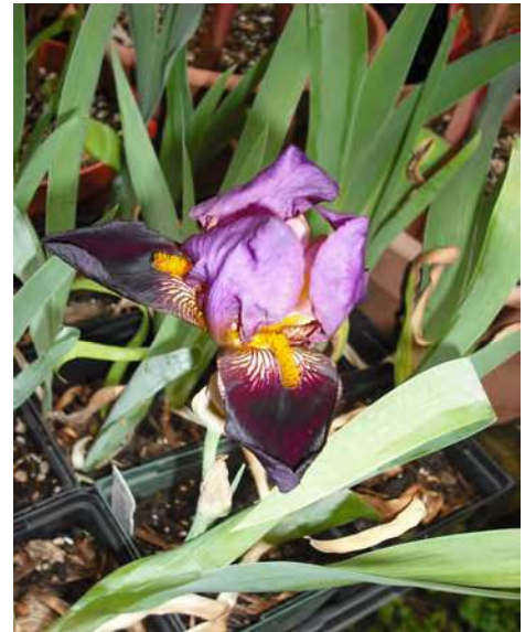
City of Stratford iris