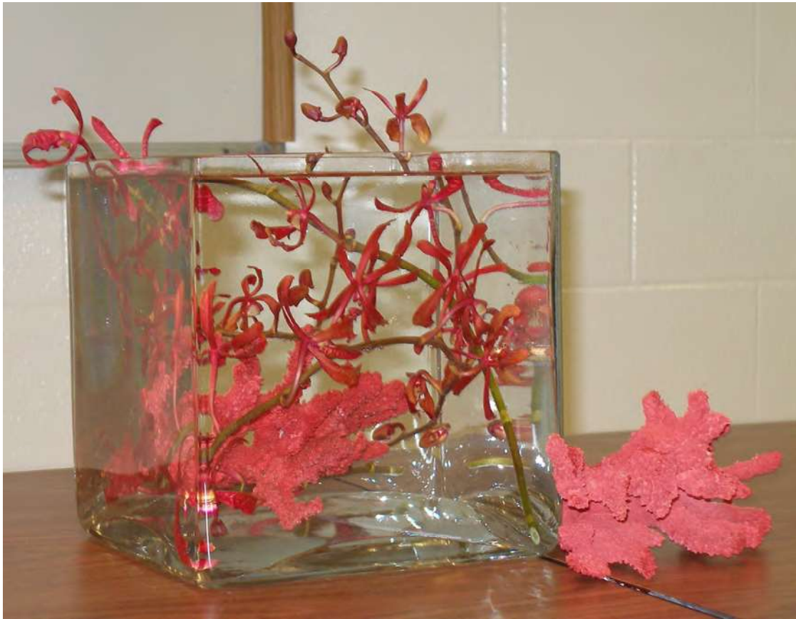
Underwater Design, Ann Diebel, 2008