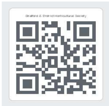
SDHS QR Scancode

Archived copies of the Society's newsletters are always available on line and don't forget to review activities of other District 10 Societies for featured events in the region that might be of interest.