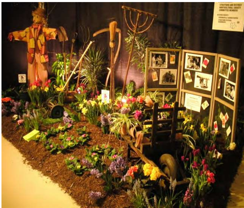
SDHS display at the Garden Festival