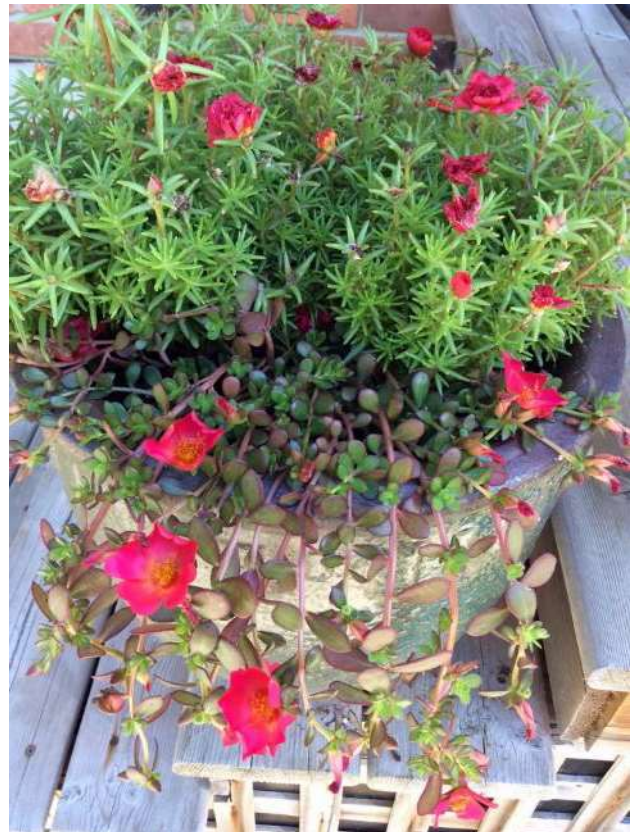
Portulaca 'Happy Hour' mix (top) and ornamental purslane (bottom) in a pot near our sunny and hot driveway. The purslane does better.

As we ponder and plan for our gardens in 2017, it is always fun to make new acquaintances. Consider sharing your new garden discoveries in the next newsletter.