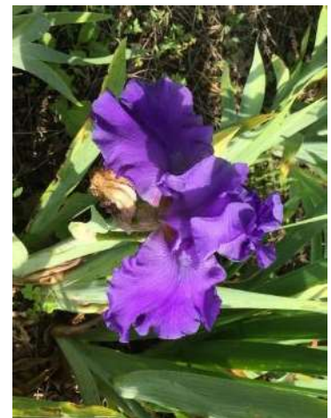
An iris from 2016 bed.

In spite of the challenges presented by this project it has been an educational and gratifying experience to work with such dedicated and patient volunteers, hardworking mentors and helpful city workers to provide an inviting public space that we trust people will enjoy for years to come.