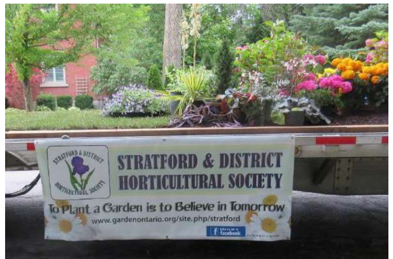
A small portion of our 2016 float. MM

We can only hope that as your Board we are exhibiting good stewardship in spending this money each year. But if you have ideas as to how we should do things differently, we'd be pleased to hear from you.