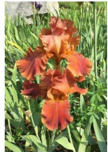
Another iris from last year.