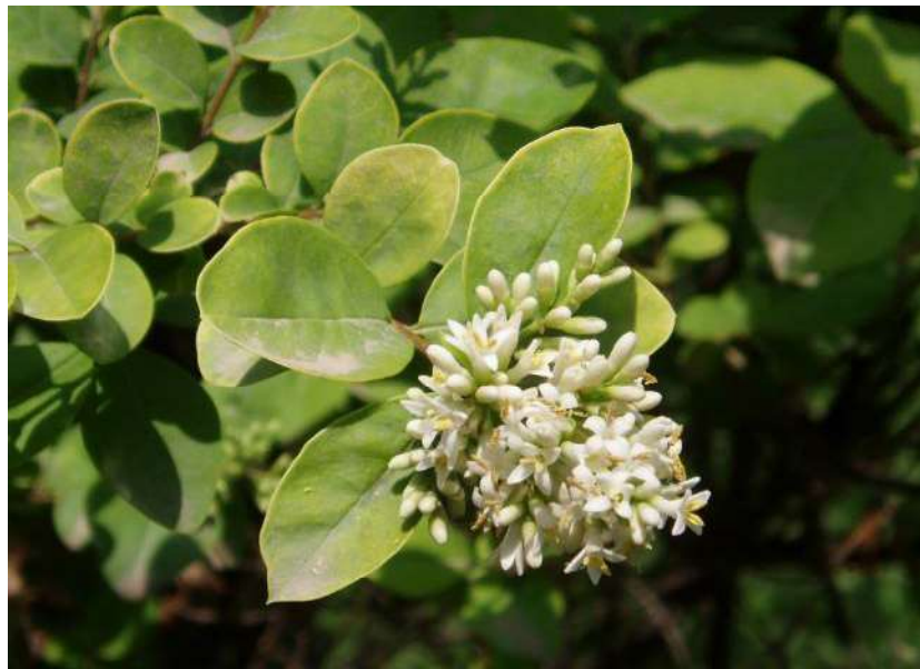
Golden Vicary Privet

Our successes should provide valuable reference to any Stratford gardener.