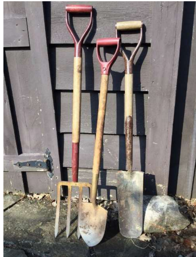
Tools that could use some attention.

It takes several seasons of working the land, adding dressings of humus, before a good workable bed is achieved. In the meantime the ground can easily form a crust hard after a good rain. This is where the hoe comes into use. The hoe is used mainly to topple weeds without disturbing the ground too much, just enough separate the weed from its root, for this reason the hoe too must be sharp. The movement of the hoe breaks up the soil surface enabling the essential movement of air and water. Note that as the roots develop so too will the micro-organisms and other soil dwellers so shallow hoe work is needed.