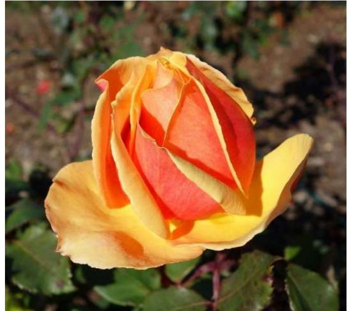
Rose 'About Face' - Humboldt Botanical Garden - Eureka, California. Creative Commons License.

One neat technique with straggly shrub roses is to take the long stems and pin them to the ground in an arch. This causes new growth along their length to sprout and grow upwards giving a fine spray of bloom