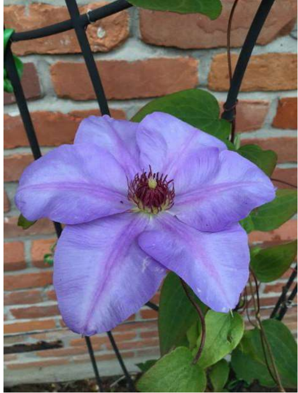
A Very Late Blooming Clematis, Oct 29!

Please send a note to SDHS1878@outlook.com .