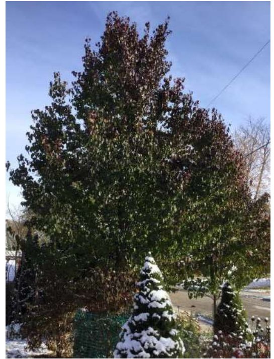
Chanticleer pears. Nov 11, 2017.