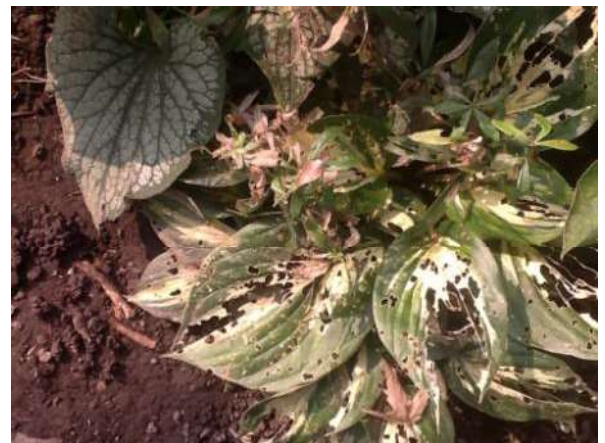
Hosta - Revolution.