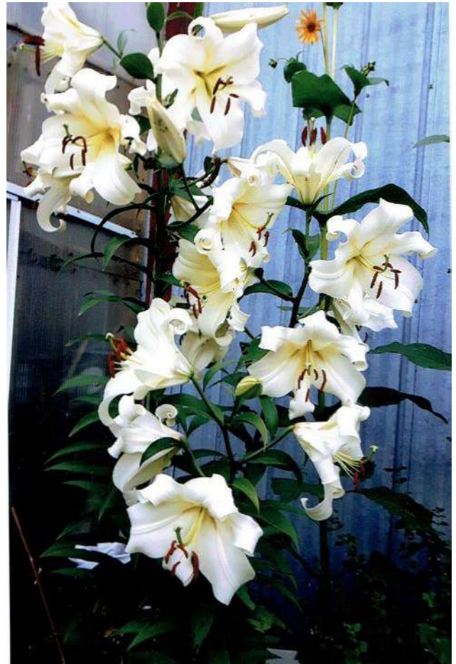
Lily 'tree' with 23 blooms. From Cobe Giroux.