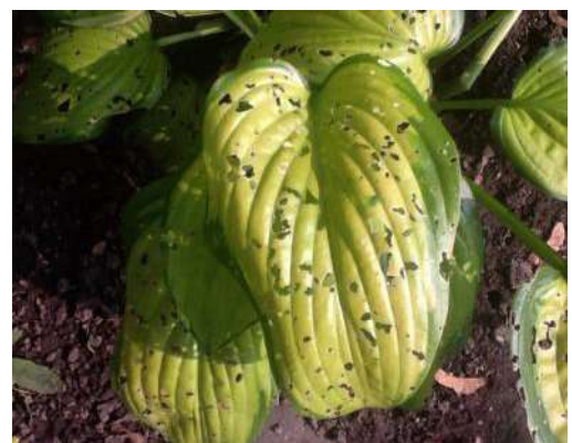
Hosta - Stained Glass.