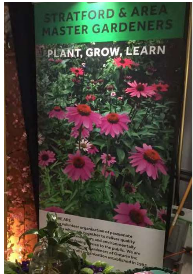
1MG Banner, Photo by Anu MacIntosh-Murray