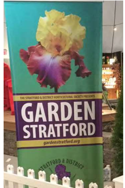
SDHS Banner.