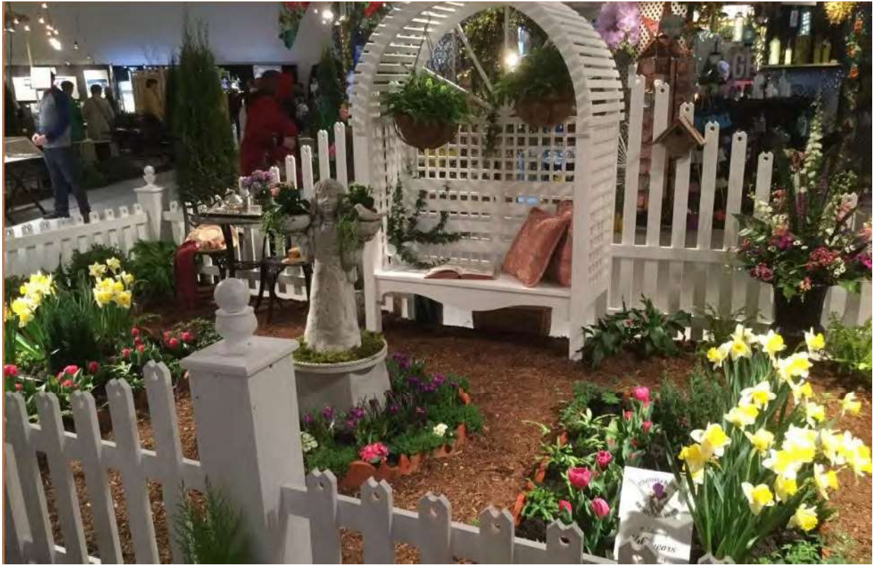
Stratford Garden at Festival.

The SDHS would like to thank the many volunteers and contributors to their successful garden display at this year's Stratford Garden Festival. This includes Home Hardware, Sebringville Nursery, Klomps, Touch of Dutch, Eligh Feryn Designs, Flowers on York and the many members who gave of their time.